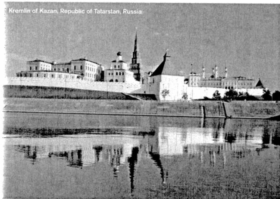
Kremlin of Kazan, Republic of Tatarstan, Russia

The bank had focused on foreign trade operations, such as cross-border transfers, guarantees and letters of credit. Unfortunately, its retail Islamic offering was limited to deposits, money transfers and mortgages, with the latter being launched shortly before the bank's closure. Furthermore, the bank had no branches and was not widely known to the general Muslim public even in Moscow (the city which hosted the bank's headquarters), let alone regionally. Badr-Forte, however, tried to compensate for its absence of outlets by actively promoting both internet and mobile phone banking.